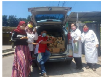
Figure 11 Delivery JAMULACANG INSTAN to LPPM Unesa