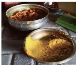
Figure 4 Result of grater empon-empon