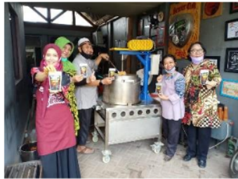
Figure 7 JAMULACANG INSTAN completed in production