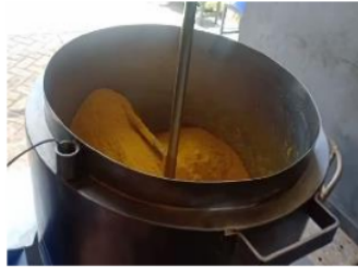
Figure 6 Extraction Process "JAMULACANG INSTAN"