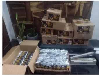
Figure 10 JAMULACANG INSTAN Finish Packed