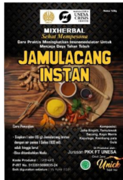
Figure 8 Wrap Packaging "JAMULACANG INSTAN"