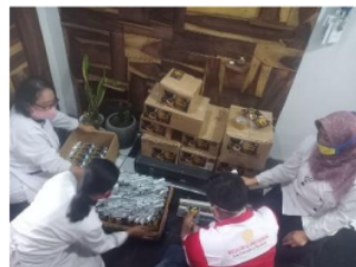
Figure 9 Packaging Process