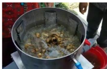
Figure 2 The process of washing and stripping the empon-empon

The activity of the "Instant Jamulacang" production process by the PKM program implementation team can be seen in the photo of the following activity: