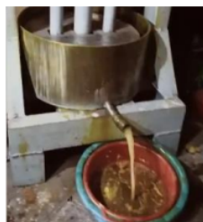
Figure 5 Pressing/squeezing the empon-empon (Ginger)